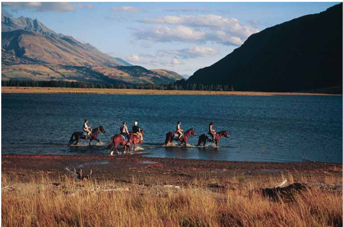
Horses at Diamond Lake looking south from Paradise