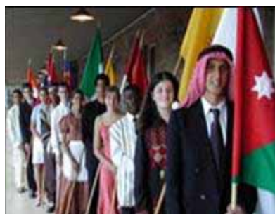
UWC draws in 124 countries