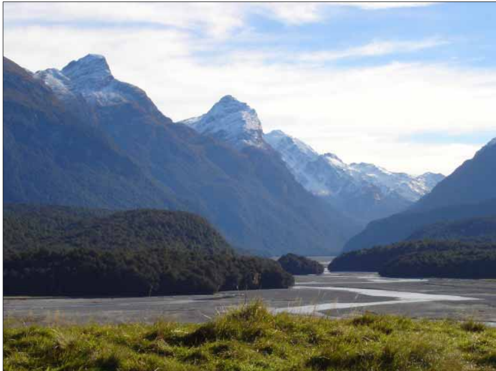
View to north from possible building site

The Paradise property is located 65 km from Queenstown and on the edge of Te Waahi Pounamu World Heritage Park. It was bequeathed to Paradise Trust by David Miller to conserve and protect it, while encouraging sustainable educational and recreational uses.